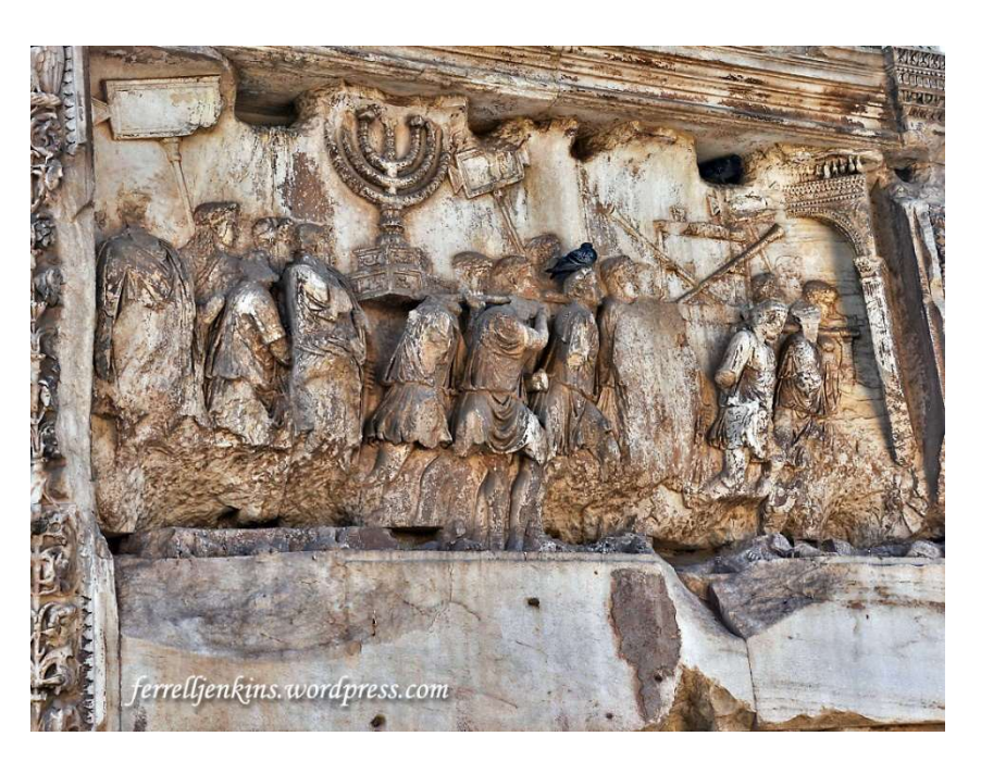
Illustration: The Sanctuary

Here is another image of how the tabernacle (the Holy Place) or the Sanctuary of the temple, was set up and furnished, with the Lampstand to the left of the altar of incense.